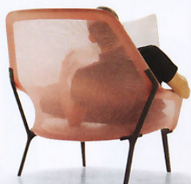
Knitted-fabric Slow Chair for Vitra

IF THERE WERE EVER any doubt that two heads are better than one, take a look at the Bouroullec brothers. Ronan, 36, who once dreamed of playing pro soccer, and Erwan, 32, work at either end of a table in their Paris studio, passing designs back and forth until they hammer out wonders like the stripped-down adjustable Joyn office for Vitra. In high demand since their Lit Clos sleeping cabin—reminiscent of a Breton peasant bed—debuted in 2000, the two have brought their playful creativity to projects for Cappellini, Kartell and Ligne Roset. Their guiding design principle, that products should be adaptable to their customers' lives, is best seen in their popular 2004 Algue system for Vitra. It may look like plastic seaweed, but when snapped together, it transforms into either a wall covering or a room divider in limitless variations. It's doubly good news then that this year the duo debut a chair for Kartell, alongside new Magis Steelwood pieces.