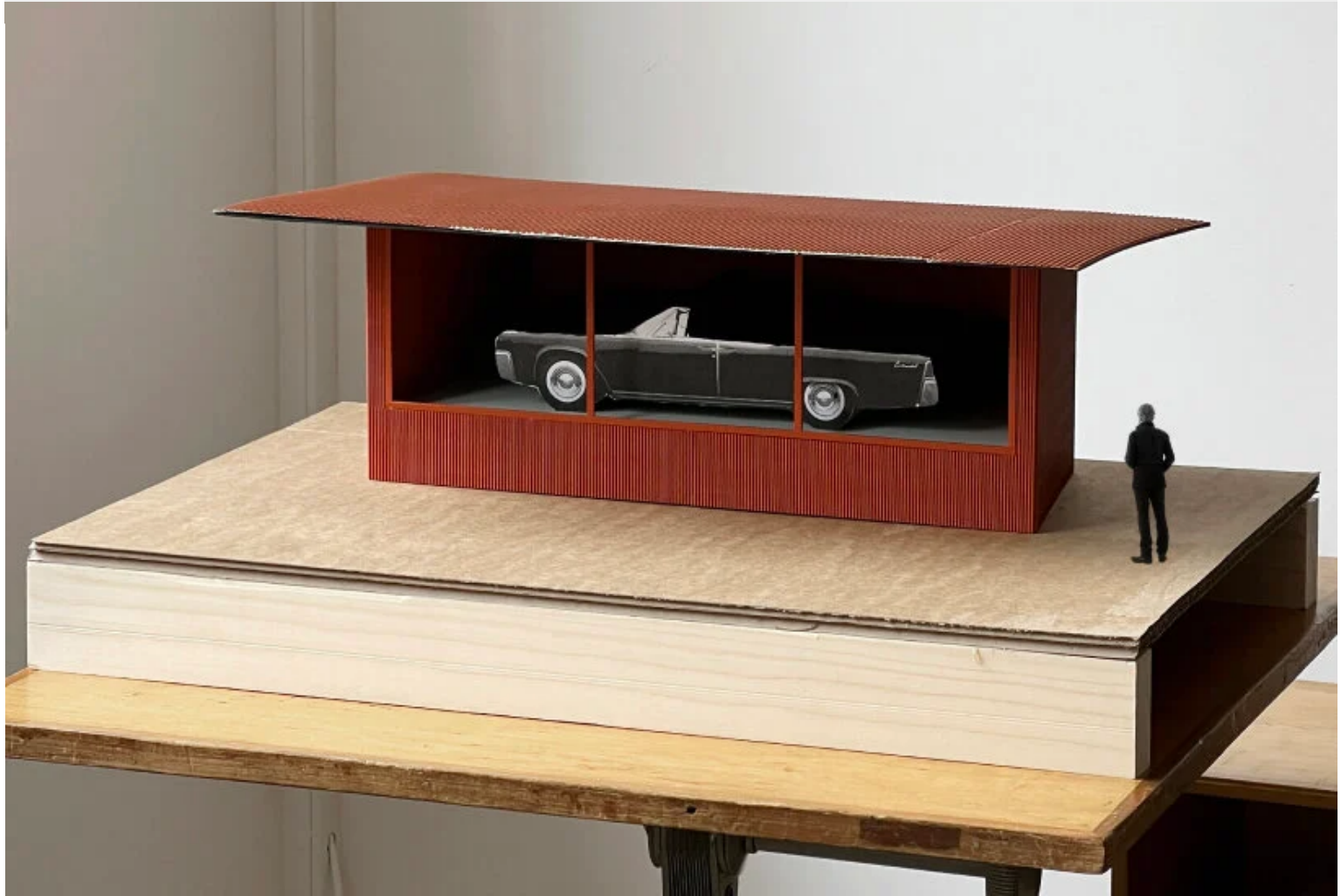
prototype of ronan and erwan bouroullec's car shelter

LASCIATE OGNI SPERANZA O VOI CHE ENTRATE (divine comedy, dante alighieri)