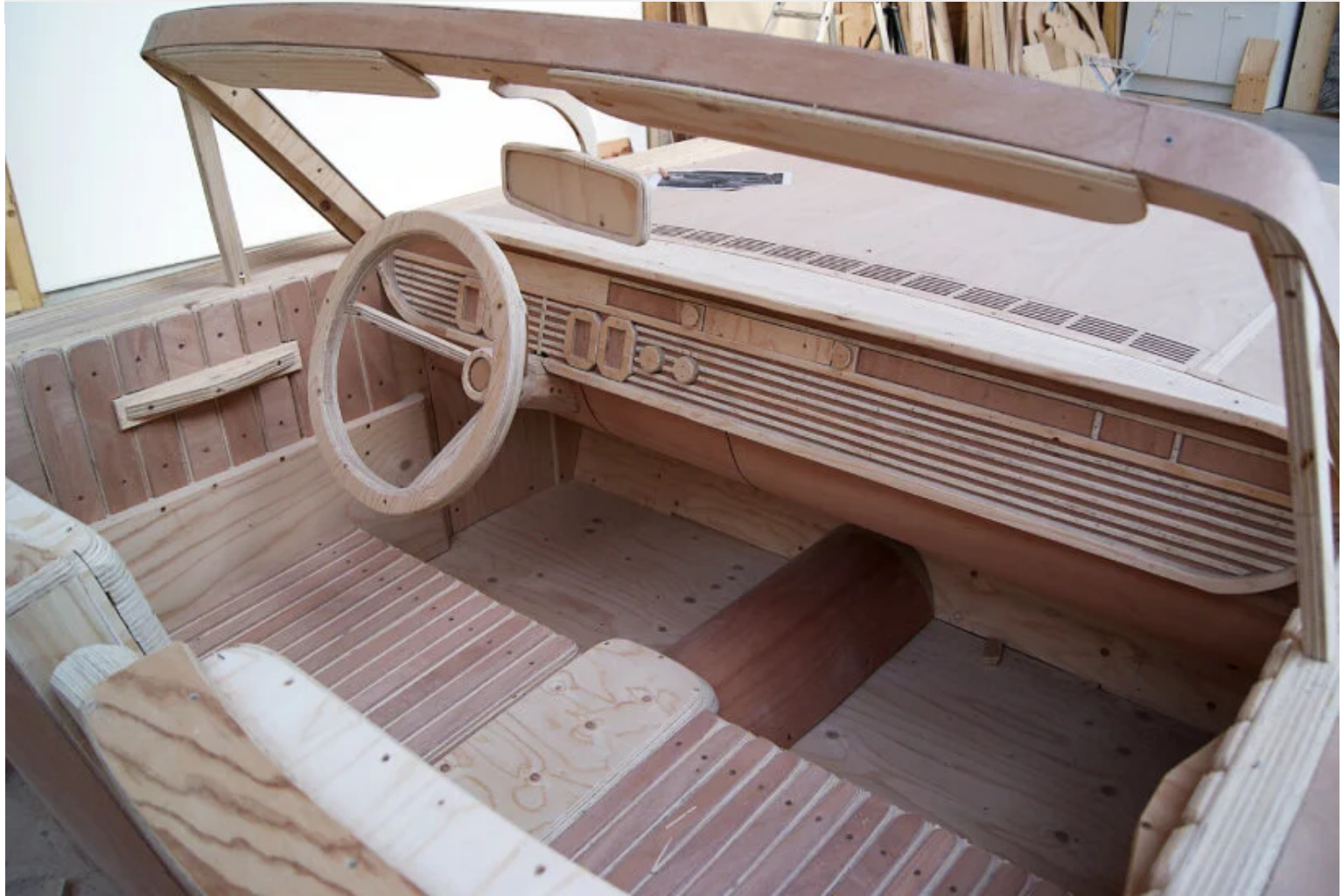
Lincoln sculpture by Pascal Rivet / image by Pascal Rivet

LASCIATE OGNI SPERANZA O VOI CHE ENTRATE (divine comedy, dante alighieri)