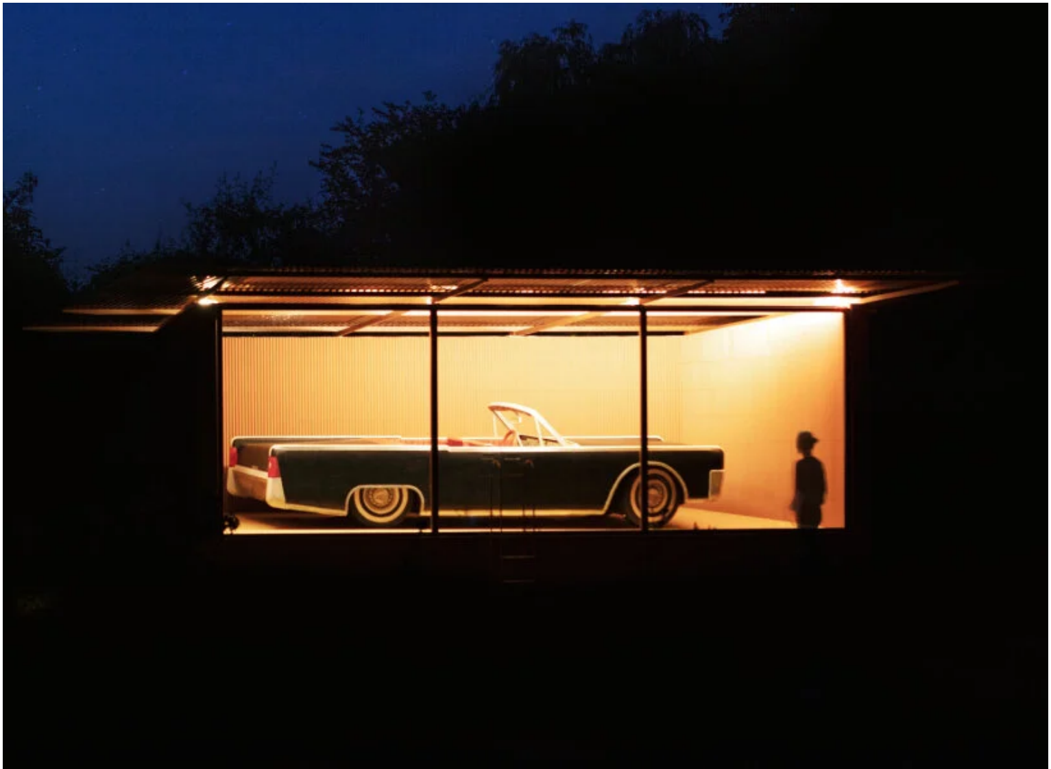
Ronan and Erwan Bouroullec designed ceramics, glass shelter for lincoln continental sculpture

the principles of their designs gravitates toward them picking up projects that sit close to their hearts.