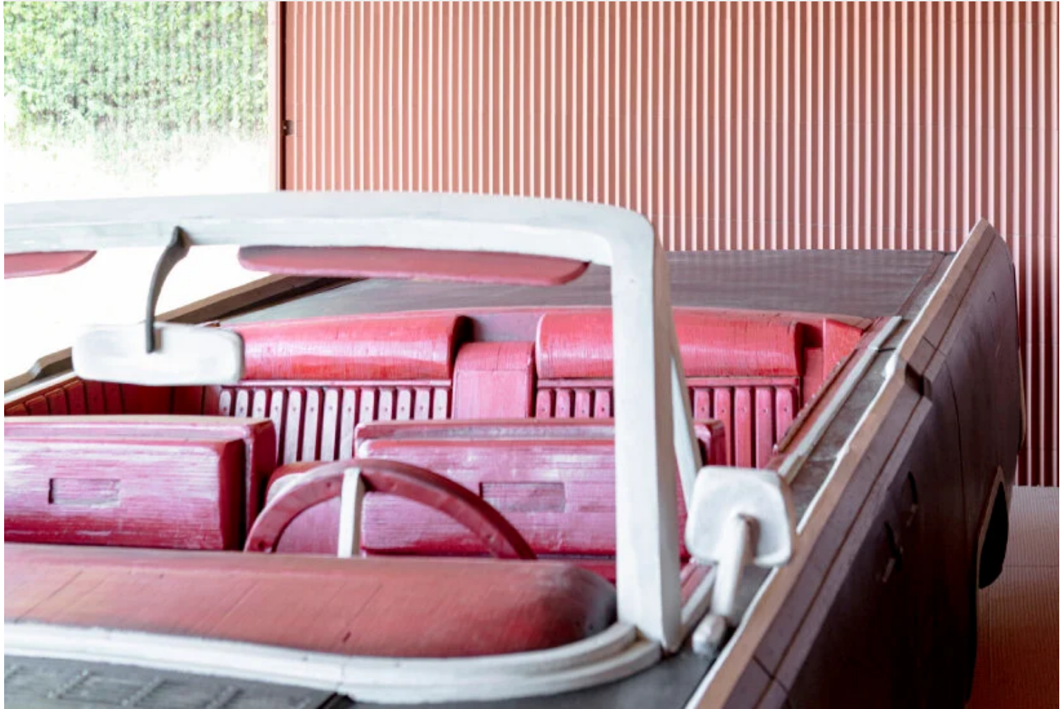
inside view of ronan and erwan bouroullec's car shelter

LASCIATE OGNI SPERANZA O VOI CHE ENTRATE (divine comedy, dante alighieri)