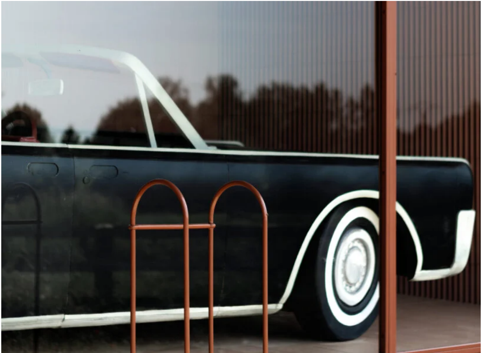
close-up view of ronan and erwan bouroullec's car shelter

LASCIATE OGNI SPERANZA O VOI CHE ENTRATE