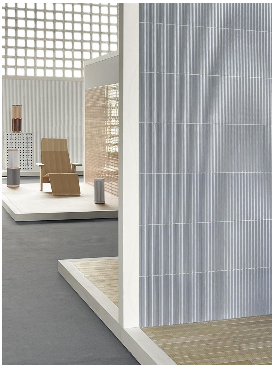
A display featuring the 'Ensemble' collection, including 'Bloc' and 'Rombini' (background), 'Punto' (middle), 'Rombini' and 'Pico Bois' (foreground)

Entitled 'Ensemble', the collection, designed by Ronan and Erwan Bouroullec , encompasses tweaked editions of two great classics, 'Pico' and 'Rombini', two new ceramic collections, 'Punto' and 'Bloc', and a venture with a new material, 'Pico Bois', where the pattern of the Pico collection can now appear on a wooden floor.