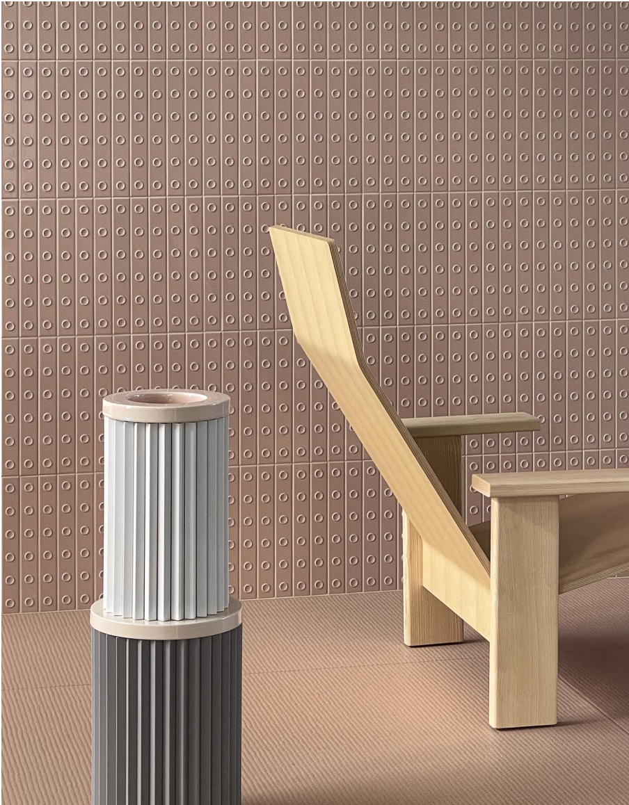
'Punto' (wall) and 'Pico' (floor)

'The most amazing thing is to see how all these collections blend perfectly when they are used together,' say Ronan and Erwan Bouroullec . 'They allow for infinite solutions: the same element, matt or glossy, pink or green, evokes different sensations, providing great variety and coherence at the same time.' ✨