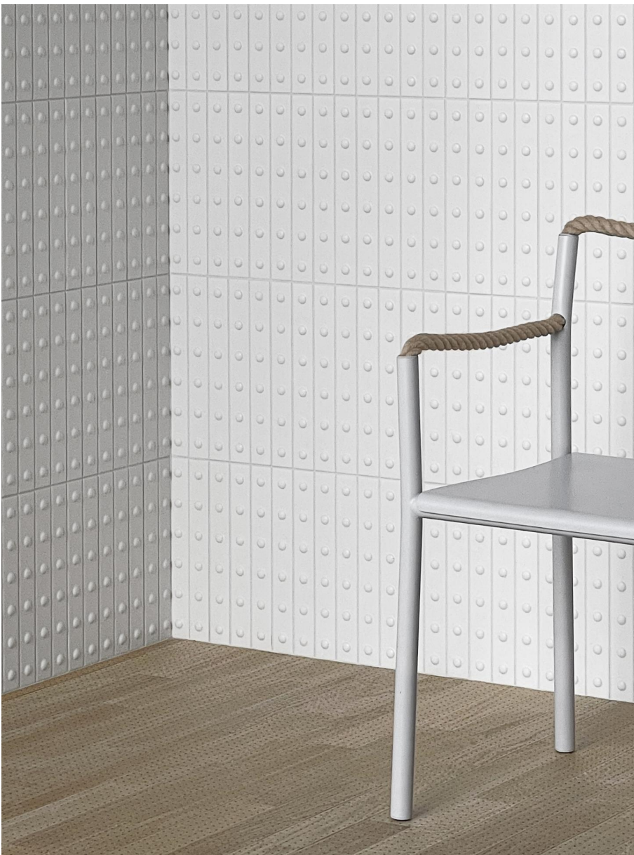
'Punto' (wall) and 'Pico Bois' (floor)

With 'Pico Bois', Mutina has produced its first wooden flooring option. Ronan and Erwan Bouroullec were born and raised in Brittany and this collection, which echoes the dot system of the ceramic 'Pico' range, takes inspiration from the local housing of their childhood. As the climate is cooler in this part of France compared to southern regions, it's more common to have wooden parquet floors than ceramic tiles, to give a sense of warmth to interiors, and the 'Pico Bois' slats are realised in European oak, graphically enhanced by impressions of red or blue dots.