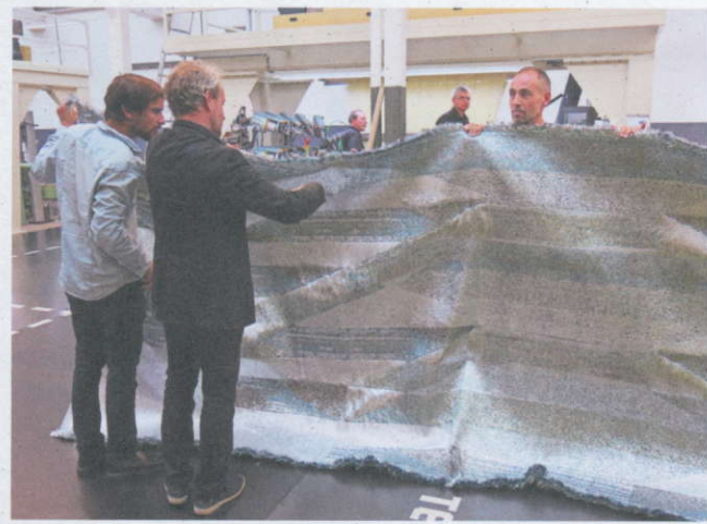
the designers checking the fabric

Ronan and Erwan Bouroullec need little introduction, with numerous contemporary classics to their name and designs that feature in modern art museums from Paris to New York and London. In this recent work, they created a multilayered jacquard tapestry with patterns and colours that change with every angle. The aim was to capture a sense of brilliance and light, which was achieved through a dynamic interplay between shiny, reflective and matt materials. The piece formed part of the brothers' recent 'Seventeen Screens' installation at the Tel Aviv Museum of Art