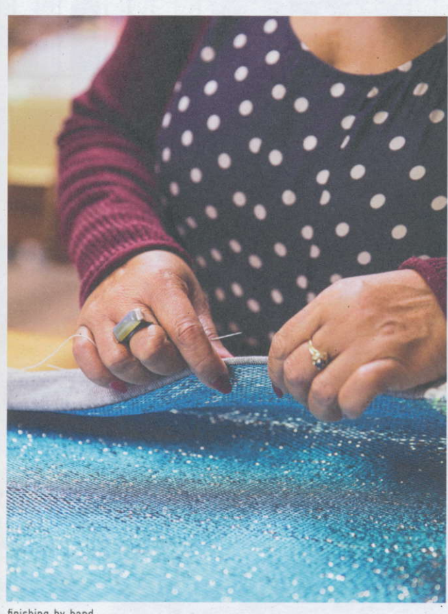
finishing by hand