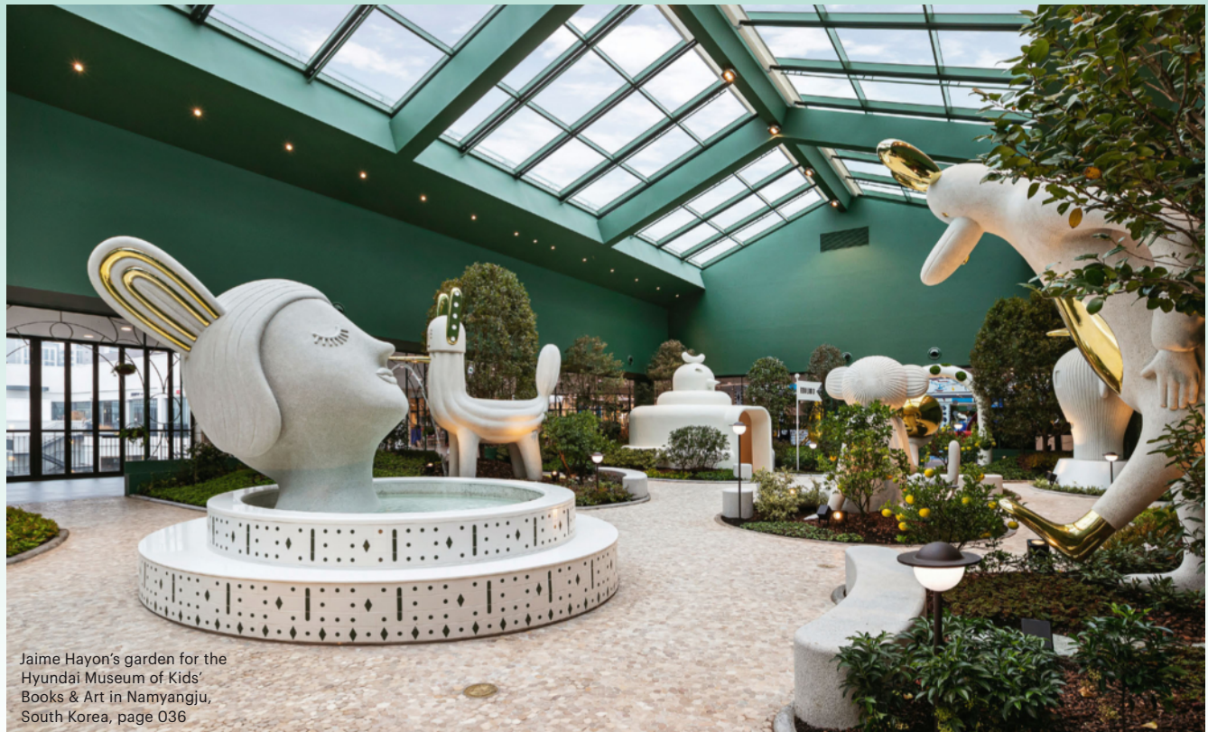
Jaime Hayon's garden for the Hyundai Museum of Kids' Books & Art in Namyangju, South Korea, page 036