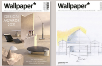
Best Sculpted Forms on our newsstand cover (winners detailed on page 053); and Tadao Ando's limited-edition cover, available to subscribers, featuring his sketch of the Bourse de Commerce