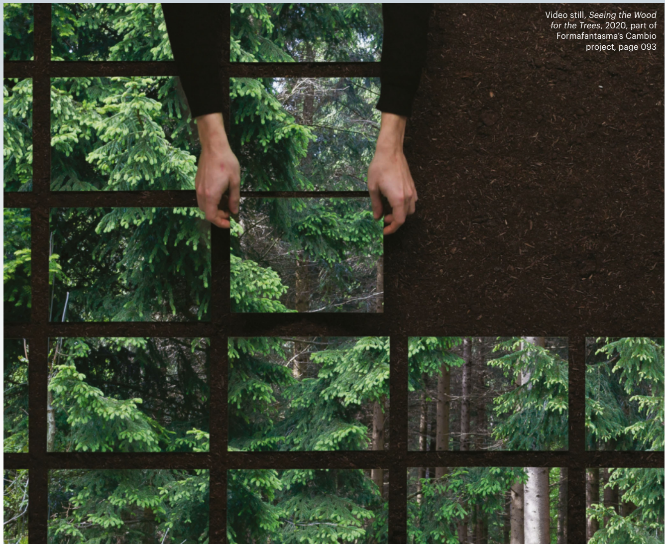
Video still, Seeing the Wood for the Trees , 2020, part of Formafantasma's Cambio project, page 093