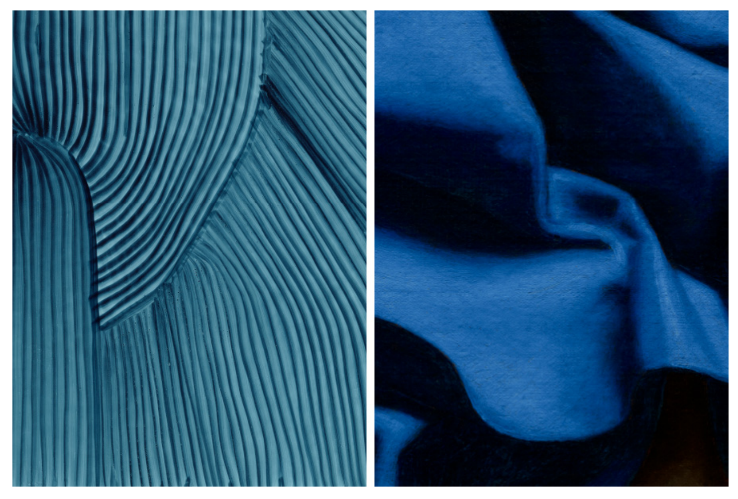
Left: drawing by Ronan Bouroullec. Right: Sassoferrato, The Virgin and Child Embracing (detail), 1660–85, The National Gallery, London

RB It's interesting, because now I don't need really to make sketches for projects anymore; I simply see them. That's the benefit of being an old designer. So now drawing and design are even more separated; I need to draw more and more, and at the same time I don't need sketches anymore.