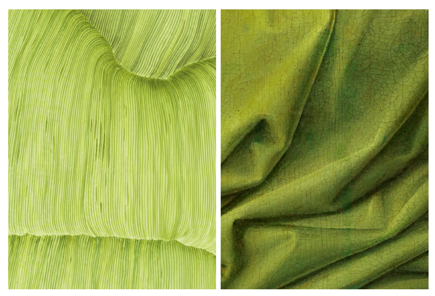
Left: drawing by Ronan Bouroullec. Right: Rogier van der Weyden, The Magdalen Reading (detail), before 1438, The National Gallery, London